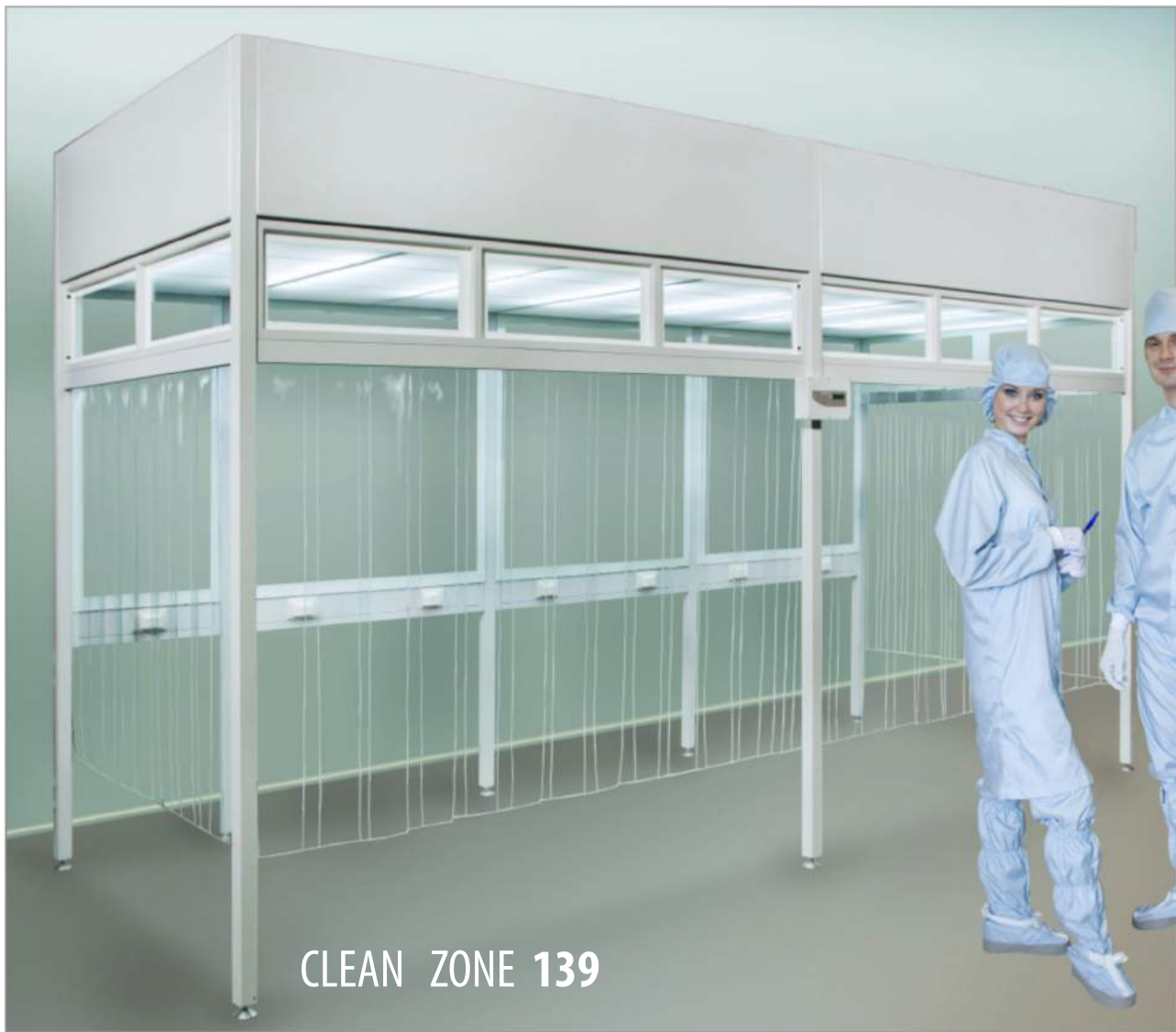
CLEAN ZONE 139