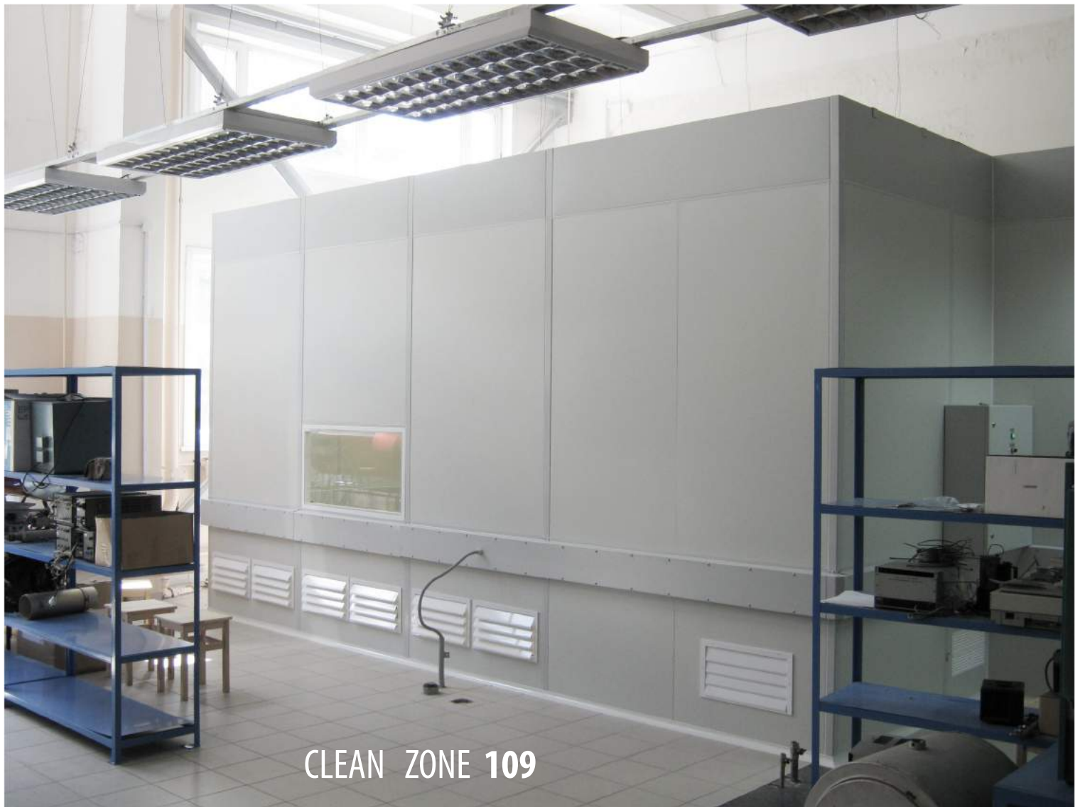
CLEAN ZONE 109