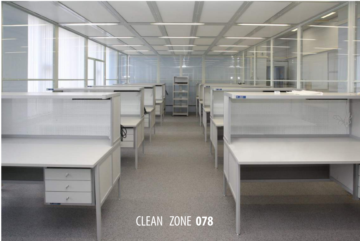
CLEAN ZONE 078