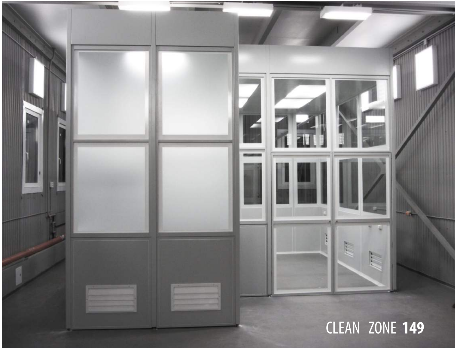
CLEAN ZONE 149