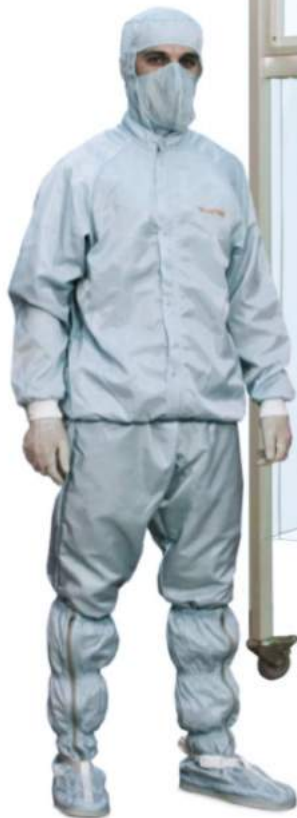
CLEAN ZONE 129