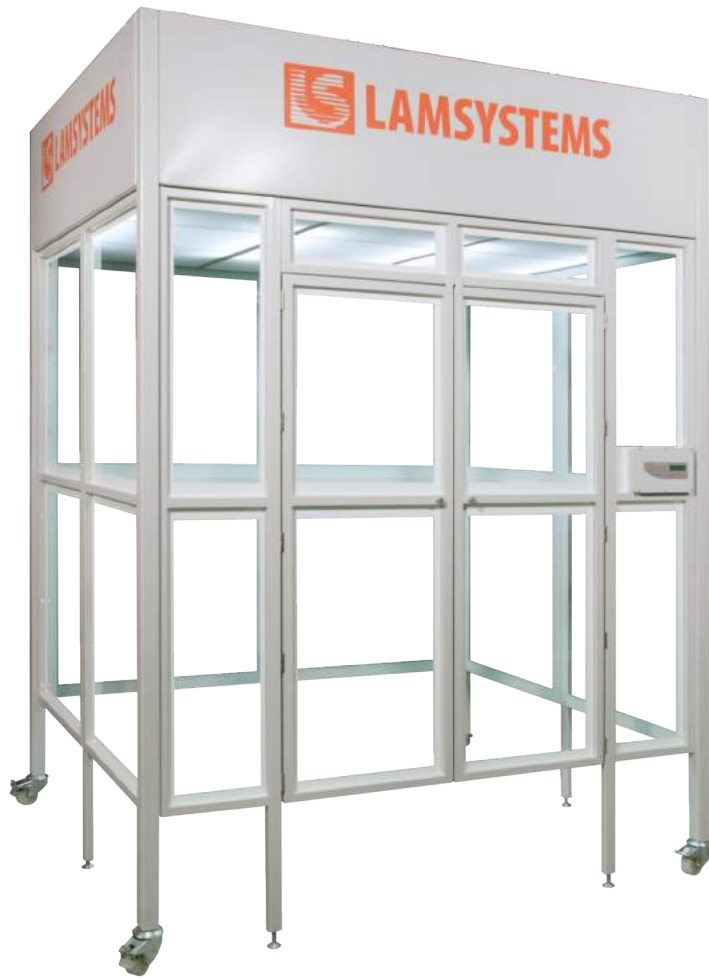
CLEAN ZONE 118