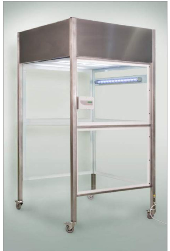
CLEAN ZONE 164