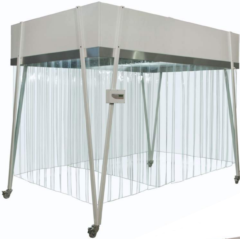
CLEAN ZONE 127