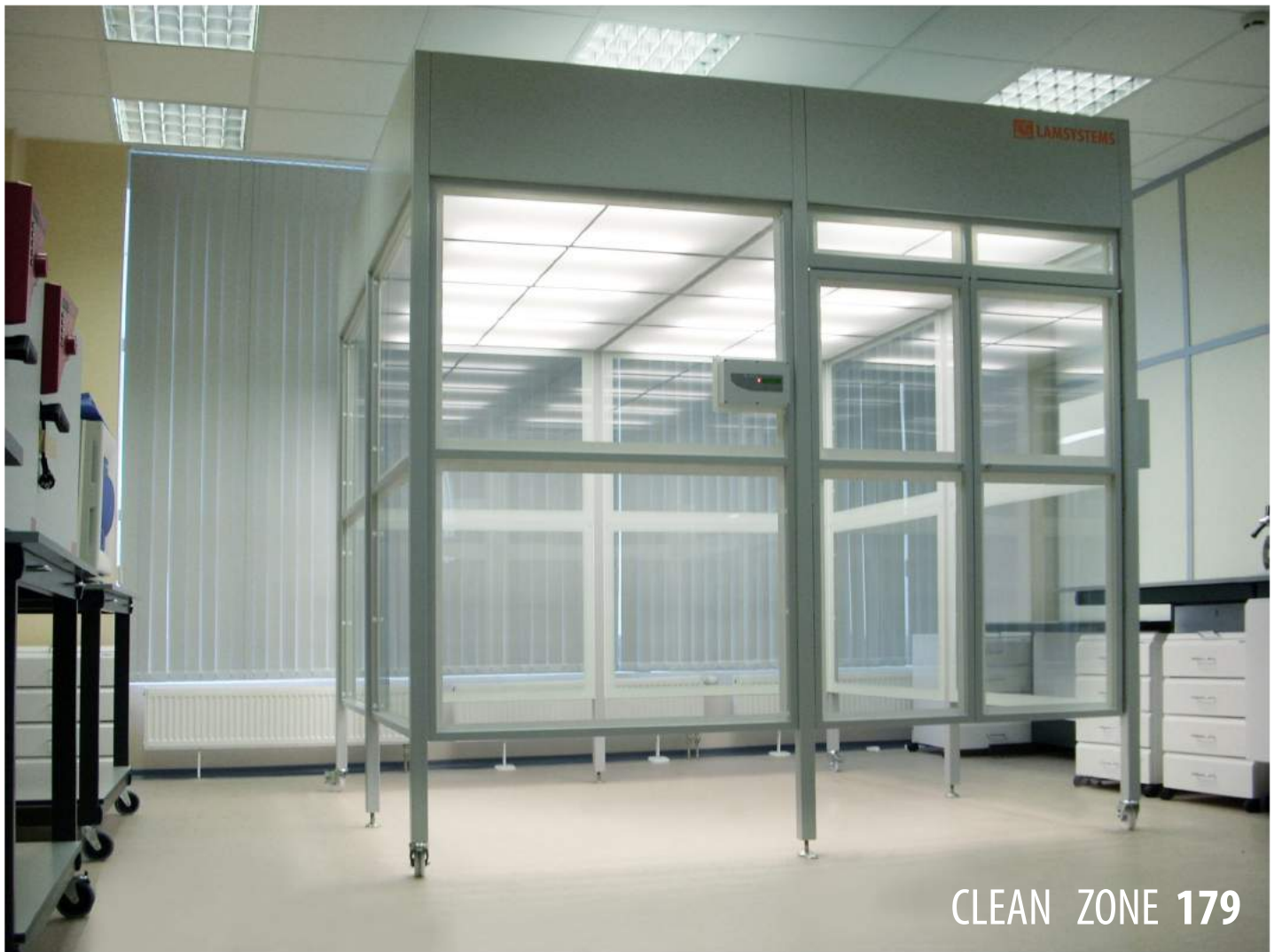
CLEAN ZONE 179