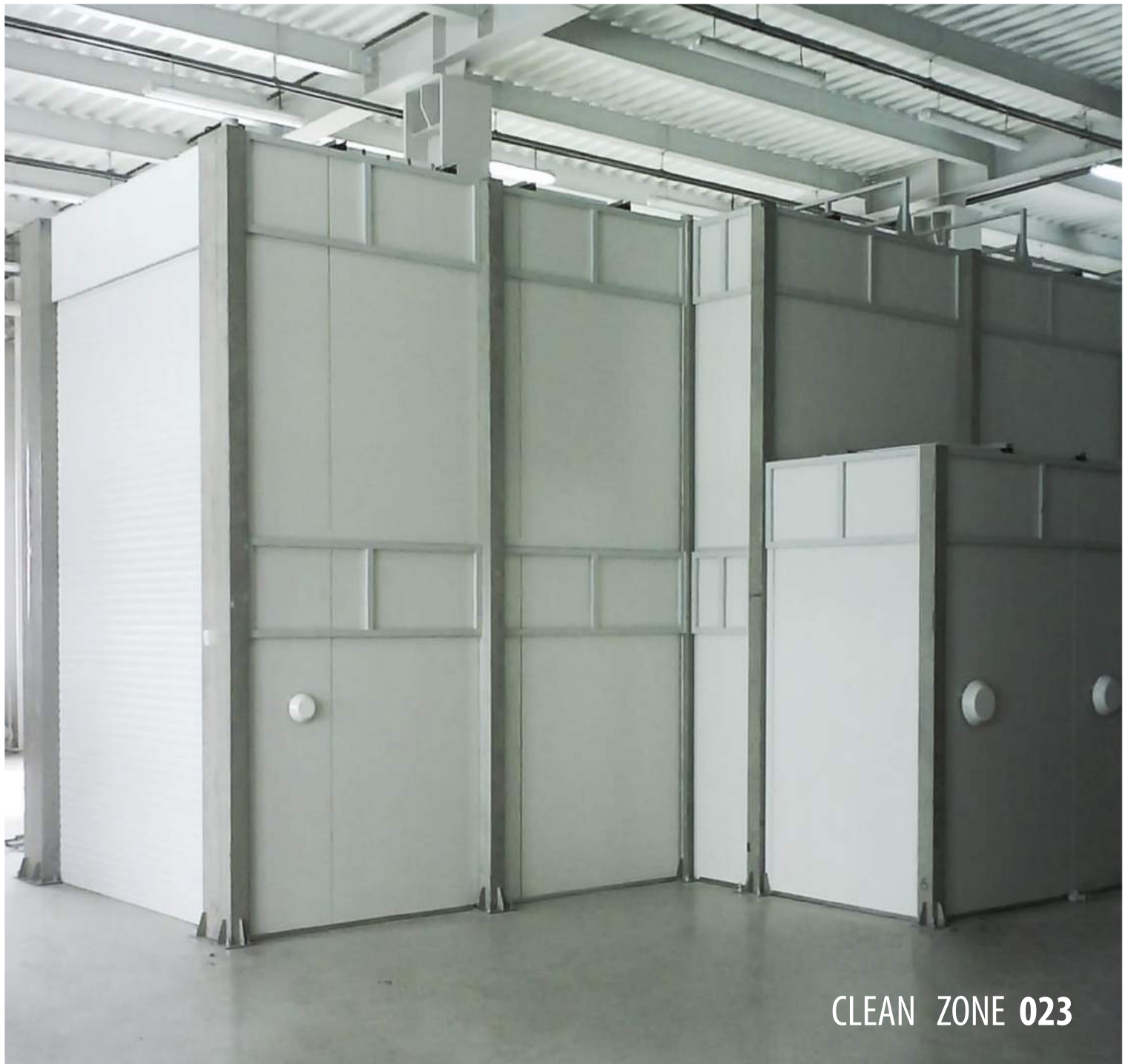
CLEAN ZONE 023