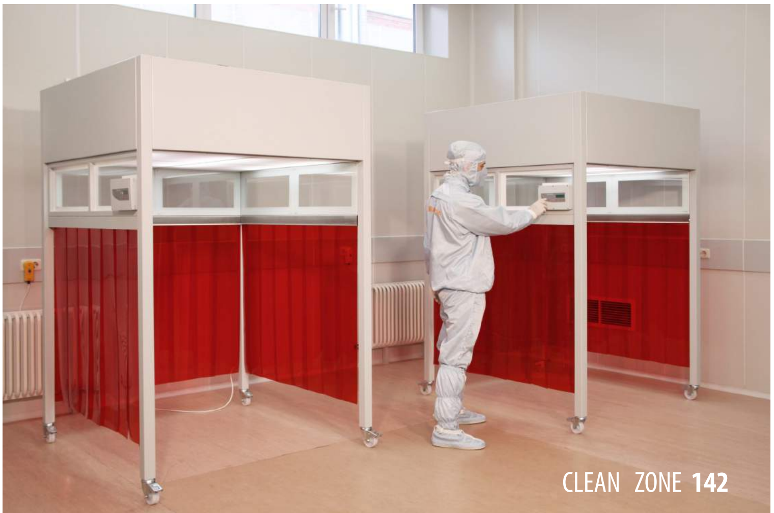
CLEAN ZONE 142