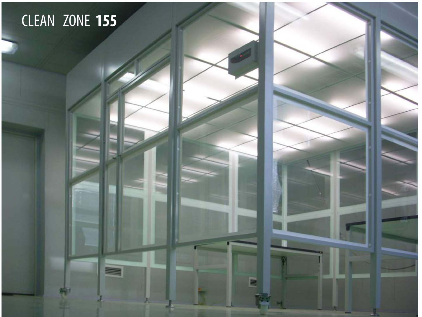
CLEAN ZONE 155